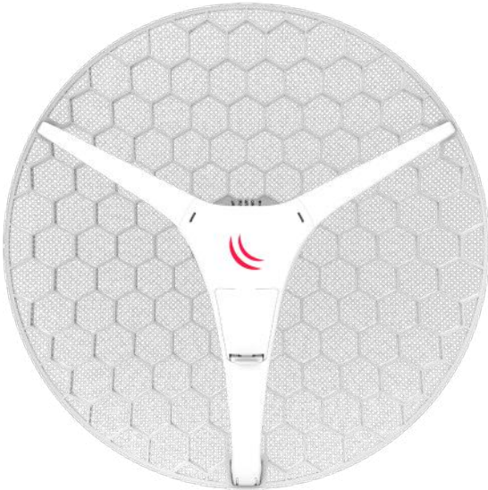
LHG XL HP5 / LHG XL 5 ac

The Light Head Grid (LHG) is a compact and light wireless device with an integrated dual polarization grid antenna at a revolutionary price. It is perfect for point to point links or for use as a CPE at longer distances. Several models are available with standard power, high power and even the XL with a higher gain and larger grid.