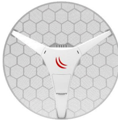
LHG HP5 / LHG 5 ac